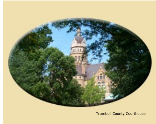
Trumbull County Courthouse